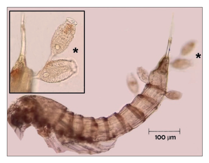
Figure 2. Posterior part of harpacticoid copeod with Thecacineta calix marked with an asterisk

Marine loricate suctorian. Whole lorica cuticle with covered by annular ridges (13–16). Length of lorica 100-110 \mu m ; width of lorica 50-60 \mu m . Macronucleus large, oviform, located at the bottom of the cell body (Dovgal, Chatterjee, Ingole, 2008) (Figure 2).