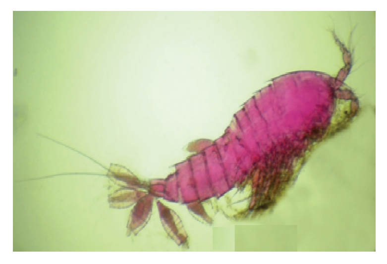
Figure 2. Epibiont Thecacineta calix at host (harpacticoid copepod) body

Diagnosis: Marine loricate suctorian. Cell body entirely fills the lorica and attach to its base. Loricais ribbed with a series of transverse annular ridges that become progressively closer toward the base. Apical part of body protrudes beyond lorica aperture. Clavate tentacles (up to 30) arise from apical surface of body. Curved stalk with apical widening. The macronucleus ovoid and located in the basal region of the cell body. Large contractile vacuole located usually near macronucleus in the basal region of body.