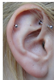
Figure 31. Very wide