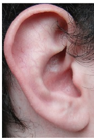
Figure 14. Underdeveloped