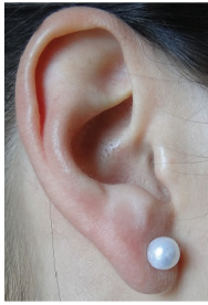
Figure 6. Underfolded