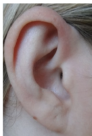
Figure 24. Underdeveloped