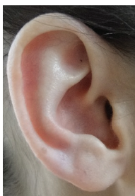
Figure 23. Convex

Feature: Anterior profile of the earlobe