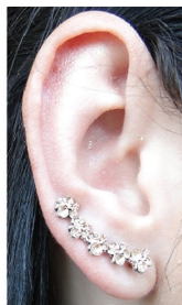
Figure 29. Moderate