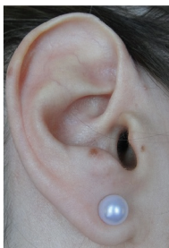
Figure 2. Underfolded

Feature: Folding of the upper edge of the helix (superior helix)