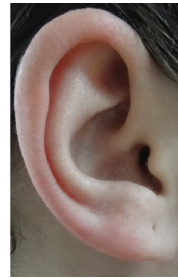
Figure 12. Single eminence