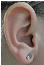
Figure 3. Underdeveloped