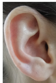
Figure 4. Moderate