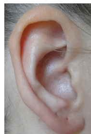
Figure 25. Concave