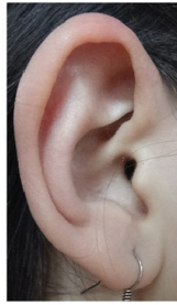
Figure 18. Moderate