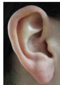
Figure 5. Prominent

Feature: Folding of the lower edge of the helix (descending helix).