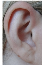
Figure 19. Prominent