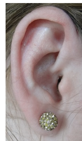
Figure 16. Prominent