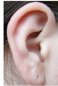
Figure 13. Bifid (split)