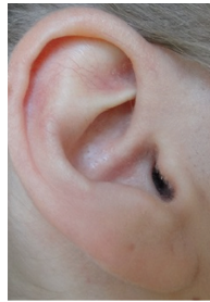
Figure 11. Long