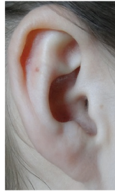
Figure 7. Underdeveloped