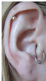
Figure 26. Attached