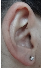
Figure 20. Underdeveloped