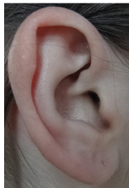
Figure 21. Moderate