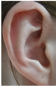
Figure 10. Short

Feature: Formation of the crus of helix Feature: Shape of the tragus