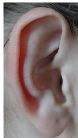
Figure 27. Detached