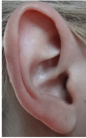
Figure 17. Underdeveloped

Feature: Formation of the superior crus of antihelix.