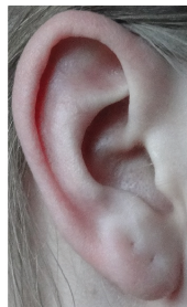
Figure 15. Moderate