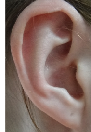
Figure 22. Prominent

Feature: Anterior profile of the earlobe