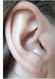
Figure 9. Prominent

Feature: Formation of the crus of helix Feature: Shape of the tragus