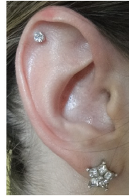
Figure 8. Moderate