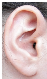
Figure 30. Wide