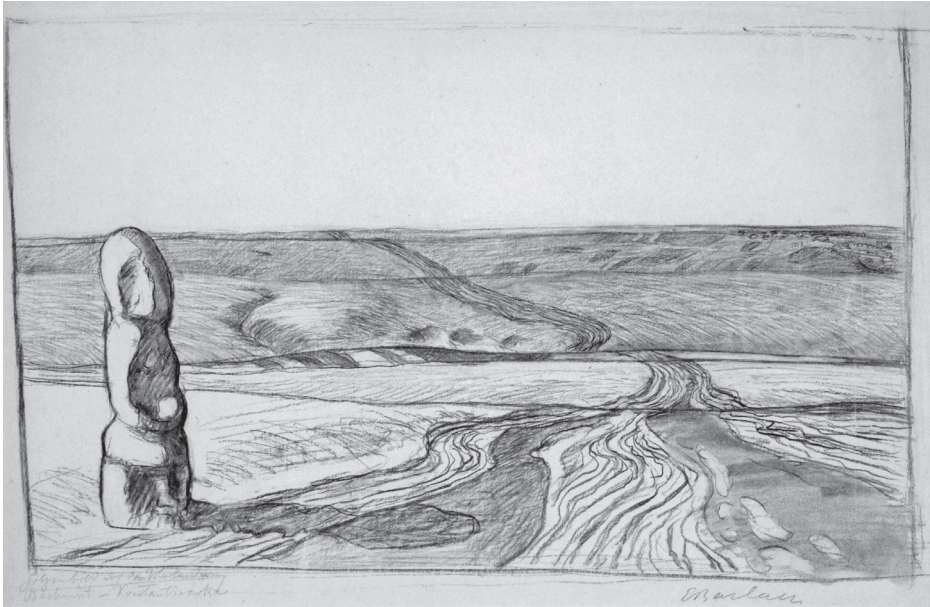
Fig. 5. Ernst Barlach, Steppe landscape with the “Balabanov”, 1906. Ernst Barlach Stiftung Güstrow

for the German, enchanted by the rawness and “authenticity” of the East, a “milestone of the lower limit of time” ( Markstein der unteren Grenze einer Zeit ), “stone miscarriage” ( stein-erne Mißgeburt ) 31 , “crystallization of earthliness” ( Christallisierung des Irdischen ). 32 The figure of crystal and crystallization, extremely key for German Expressionists and activists of regeneration movements, was rooted in the Romantic idea of sacralizing nature and the work of human hands as a representation of concentrated natural forces. After Friedrich W.J. von Schelling, the transparent solid with regular walls became a blueprint for the future world and at the same time a symbol of the absolute truth of art, a “metaphorical tectonization and deconstruction of the classical ideal” anchored more in “active principle than in beautiful form.” In this way, “ Natura naturans [nature giving birth] became the matrix of the artistic process,” – Regine Prange argued. 33