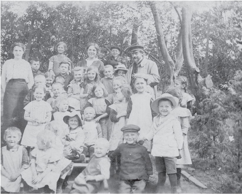
Fig. 2. Ernst Barlach as a volunteer at a childcare center in Güstrow, 1915.

A decade later, Mecklenburger offered to Biesel, as in the case of Der Findling , a figure of a seated woman obscured almost entirely by a large shawl. “One can guess” – wrote Volker Probst – “the outstretched, accepting arms underneath it, which give the region of the womb the shape of a gently depressed basin.” 9 The stocky sculpture, modeled with sharp facet cuts, received the author’s title Mother Earth (Fig. 3). The artist commissioned Hamburg stonemason Friedrich Bursch to carve it. For the figure, he chose shelly limestone from the “Franconian primordial ocean” ( Fränkisches Urmeer ), for the low pedestal – unpolished granite blocks, while the entire composition was placed on a slightly bulging, greened mound (Fig. 4). The post-war design, which was larger but formally much more austere than the previous one, thus corresponded to the guidelines for shaping the individual plots of the early modern Main Cemetery (today’s Central Cemetery). This park-like, and in some parts even pseudo-wild, as if backwoods-like surroundings were to be filled with tombstones made of German stone, being an expression of concern for the native landscape.