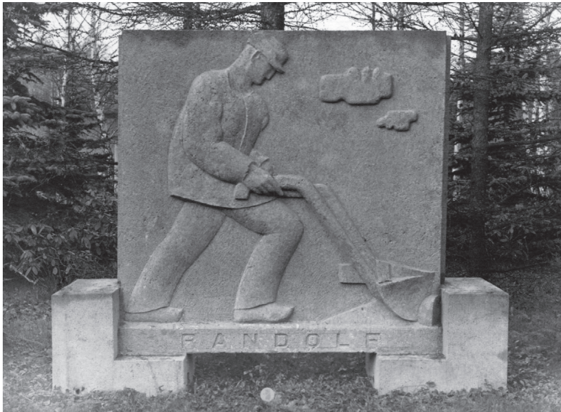
Fig. 6. Kurt Schwerdtfeger, Plowman, 1929.

to Mother Earth at the Biesel family quarters. The curators of the Provincial Museum of Pomeranian Antiquities, archaeologists and ethnographers, taking over from the director of the City Museum in this decade as the main animators of artistic life in Szczecin and the province as a whole, were referring to examples of good regional sepulchral craftsmanship, displayed in an urban park setting and contrasting with the mass trashiness of modern stonework available behind the cemetery fence. 80 Its cultural boundaries, sometimes in defiance of current administrative divisions, were defined by agricultural tradition, family and management ties of centuries-old landed estates.