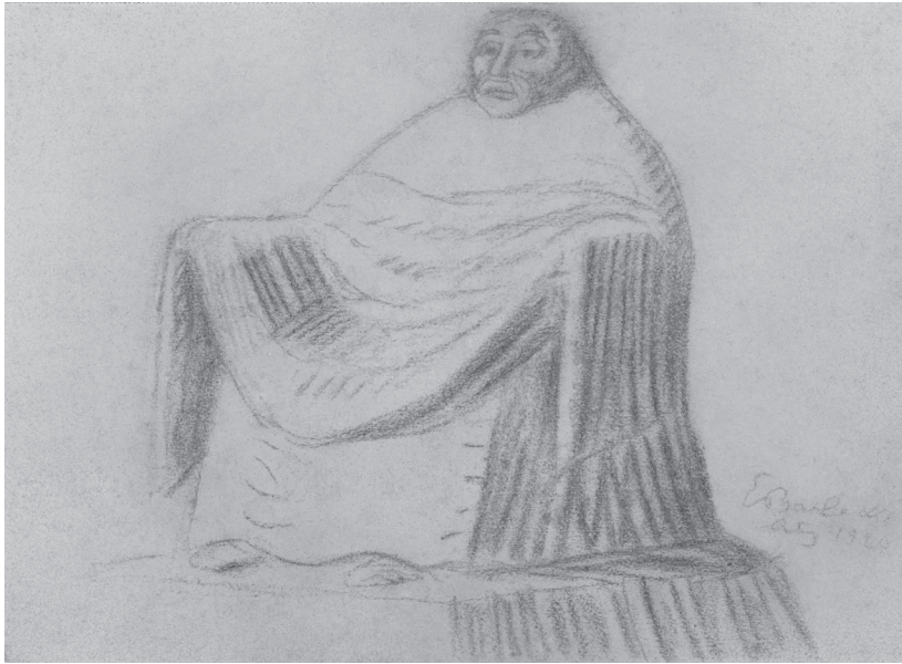
Fig. 3. Ernst Barlach, Mother Earth, sketch drawing, 1920. Ernst Barlach Museum, Güstrow

According to Hannig, the building of the Szczecin museum, for example, served as an example of the patriotic use of natural and durable materials. 10 Barlach's concept, however, was also influenced by a new – individual, though spreading – perception of space, where simplified human statues mimicked geological formations, and the texts of the dramas were given a specific topographical structure, highlighting boundary places of symbolic significance. 11