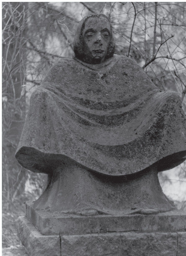
Fig. 4. Ernst Barlach, Mother Earth , 1921.

Soon after the installation of the work at the circular square, in the midst of a quasi-forest grove, two models of Mother Earth were presented at the exhibition of Norddeutsche Sezession at the City Museum in Szczecin. 12 The exhibition context was significant: the adjacent room held a set of urns from prehistoric corpse burials discovered in the southwest corner of the Main Cemetery in 1907. 13 There, the Biesel family quarters and the archaeological site were separated by a distance of a few minutes' walk, a short distance from the side cemetery gate on Berliner Straße (now Mieszka I Street).