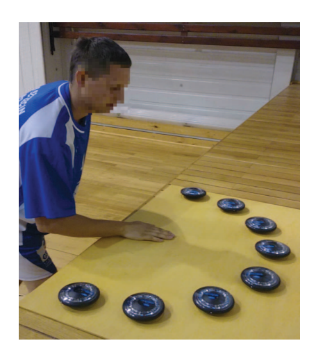
Figure 1. Station for the measurement of visuomotor task

Light discs were placed on a plate with dimensions of 110 × 80 cm at intervals of 20 cm apart and 45 cm from the designated starting point, according to the scheme shown in Figure 1. The task was to perform the fastest hand movement in order to touch the disc surface and deactivate the lights.