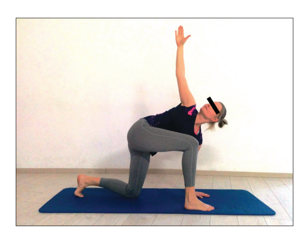
Figure 4. Example of bodyART exercise

BodyART exercises are performed without any additional accessories using just the weight of the body. The pace is calm and the movements smooth and harmonized with the breath. At the entry level of training, practitioners learn to maintain stable correct positions, and after achieving this skill, more and more difficult elements are introduced. Ultimately, the main content of the training is a combination of multi-articular movements in all planes with a large balance component, involving simultaneously many muscle groups (Figure 4) (BODYART International, https://international.bodyart-training.com/info/history; Burzawa, 2017).