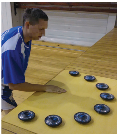
Figure 1. Station for the measurement of visuomotor task

Light discs were placed on a plate with dimensions of 110 × 80 cm at intervals of 20 cm apart and 45 cm from the designated starting point, according to the scheme shown in Figure 1. The task was to perform the fastest hand movement in order to touch the disc surface and deactivate the lights.