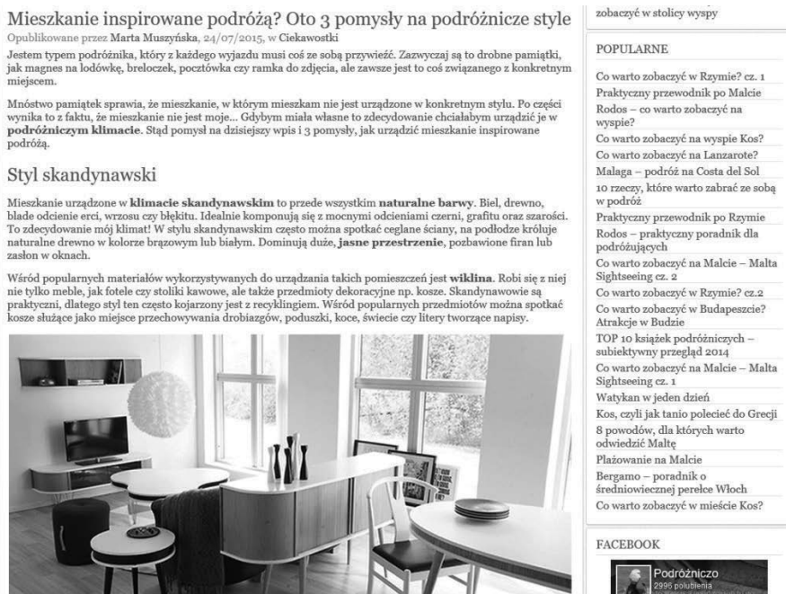
Figure 3. Post regarding interior design (Westwing brand) on the Podróżniczo blog