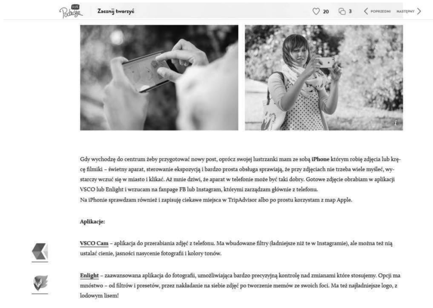
Figure 2. Post regarding the Apple phone on the Duże Podróże blog

In the network you can find numerous examples of influencers' involvement in promoting brands. Special articles and rankings of the best case studies are created, also with the divisions into industries.