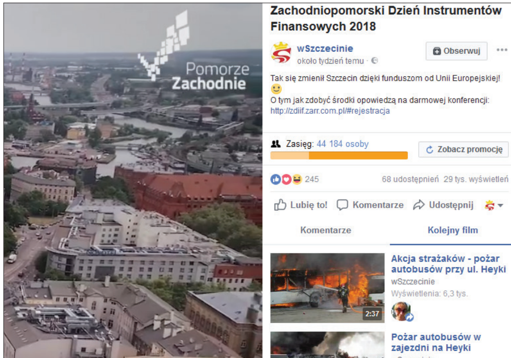
Figure 3. The sponsored post on wSzczecinie.pl