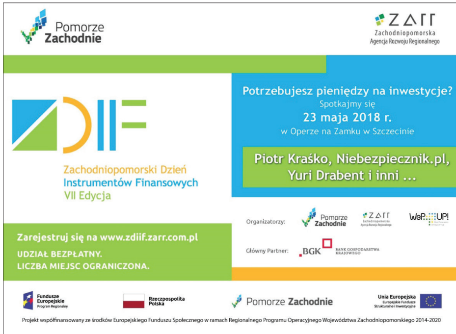
Figure 2. ZDIF conference banner