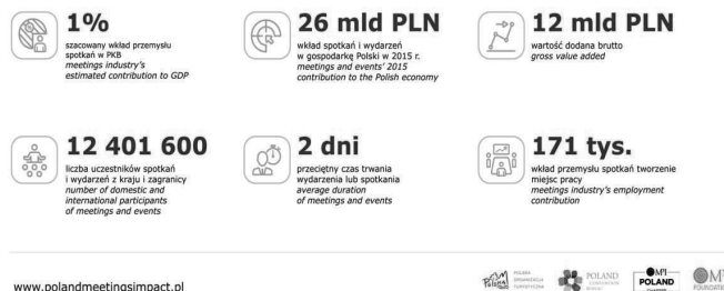
Figure 2. Poland meetings impact 2015

THE ECONOMIC IMPACT OF POLAND'S MEETINGS INDUSTRY