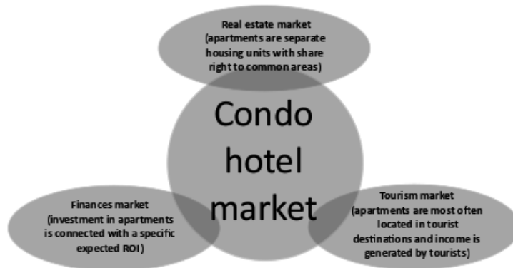
Figure 1. Interconnections between the condo hotel market and other markets