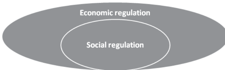
Figure 1. Social regulation as element of economic regulation

In the first instance, the social regulation is treated as an element of economic regulation while considering that market errors related to external effects, public goods and asymmetry of information are corrected to the extent that does not interfere with the implementation of economic values. The relationship between the economic and social regulation, while considering values implemented, is presented in figure 1.