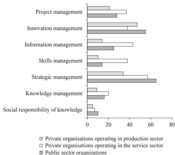
Figure 1. The use of knowledge capital in the region by building a network of cooperation between the public and private sectors